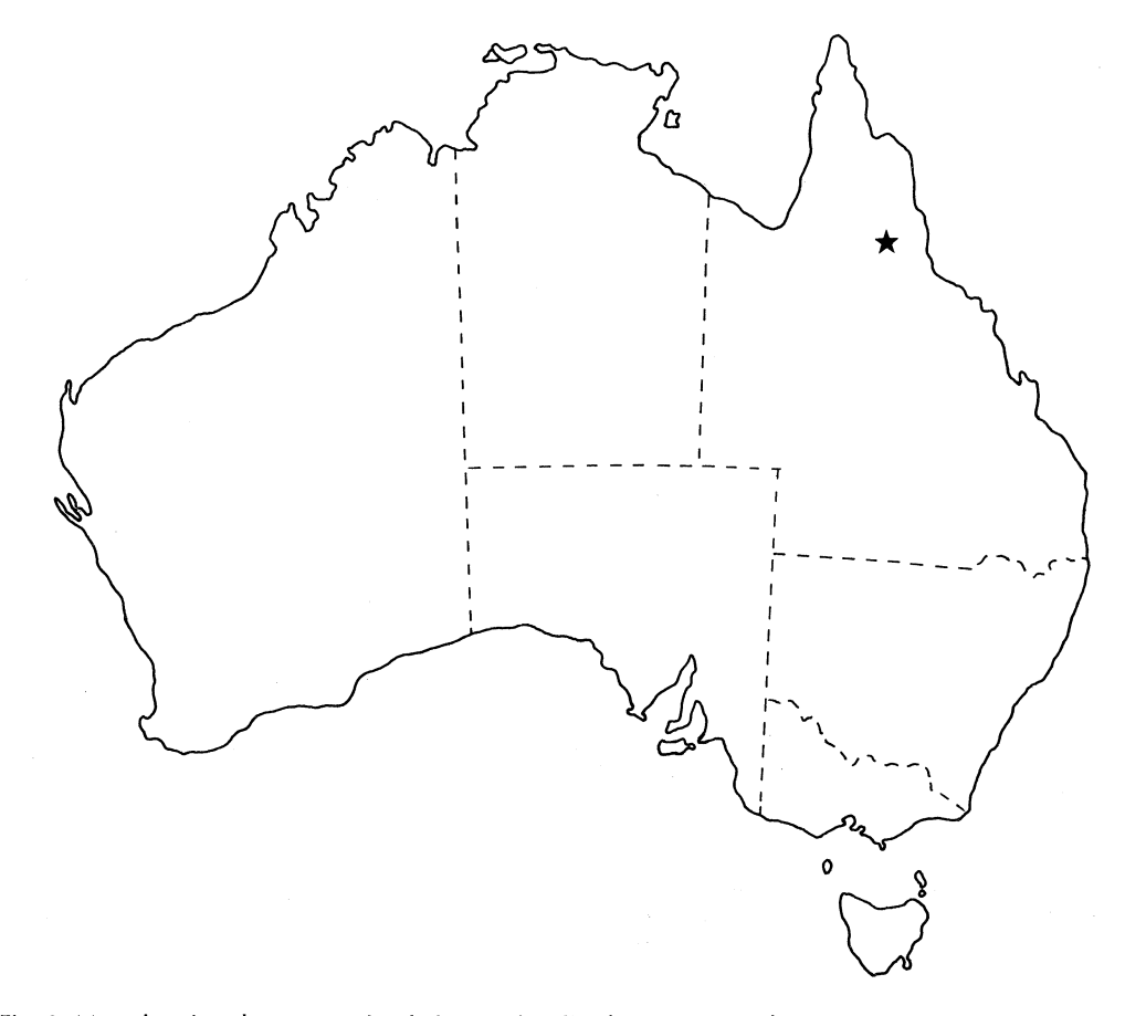
Fig. 2. Map showing the type and only known locality for Lerista ameles.

DISTRIBUTION. The species is known to date only from the type locality which is approximately 33 km east of Mt. Surprise along the Gulf Highway.