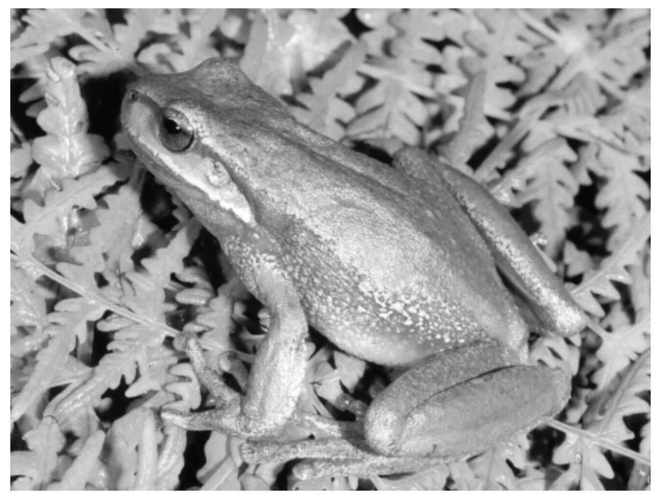
Figure 3. An adult male (SAMA R51059) L. daviesae n.sp. from the Ellenborough River, New South Wales photographed in life.

Description of holotype. Head approximately as long as broad (HL/HW 1.04), and approximately one third snout to vent length (HL/SV 0.38). Snout prominent, blunt when viewed from above and in profile. Nostrils more lateral than superior, closer to snout than to eye. Distance between eye and naris equal to internarial span (EN/IN 1.08). Canthus rostralis well defined and straight. Eye relatively large, its diameter greater than eye to naris distance. Pupil horizontal when constricted. Tympanum small, indistinct, and oval with long axis tilted towards eye. Tympanum length approximately half eye diameter (T/E 0.45). Well-developed supratympanic fold, glandular in appearance, that partially obscures tympanic region. Vomerine teeth long curved plates directed posteriorly from the front margin of the choanae. Tongue approximately rectangular.