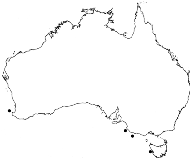
Fig. 3. Locality records for Ebinania australiae .

Distribution. Ebinania australiae is known from southern Australia off the tip of Western Australia (one specimen), off southern South Australia and Victoria (7 specimens), and off Tasmania (one specimen) at 982–1170 m (Fig. 3). The geographically closest congeneric species of Ebinania australiae is E. macquariensis from Macquarie Island, 1500 km southeast of Tasmania, and the next closest species is E. malacocephala from the far southern middle Pacific (54°49.5'S 129°47'W) (both described by Nelson, 1982). Two species, E. brephocephala and E. vermiculata , are known from the Northwest Pacific off Japan. The sixth species of Ebinania , E. costaecanariae is known from the eastern Atlantic off Spain (Quéro, 2001) and Africa (Nelson, 1982).