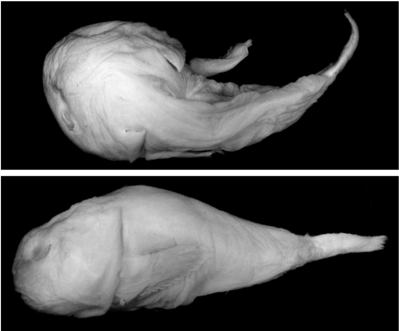
Fig. 1. Holotype of Ebinania australiae , CSIRO T 412, 206 mm standard length. Top: dorsal aspect, bottom: lateral aspect. Scale: 10 mm.

Description. Ratios and counts are given in Tables 1 and 2. Body tadpole shaped. Head large, trunk short and tapering to a small tail. Head depressed at orbits and sloping dorsally to a moderately depressed nape. Trunk round, tapering to a moderately compressed peduncle. Orbits forward, snout blunt and wide. Interorbit wide and soft. Mouth large, terminal, and oblique. Jaws equal or upper jaw slightly