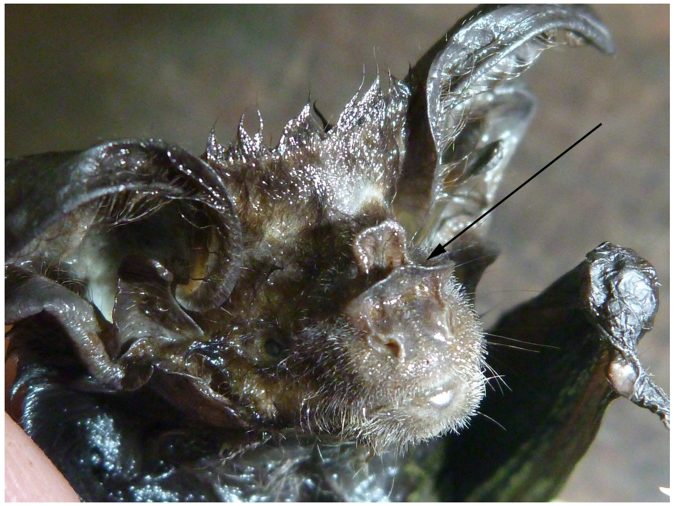
Figure 6. Close up of the snout region of the alcohol-preserved body of Pharotis imogene (PNGM27464) showing diagnostic convex dorsal margin of anterior noseleaf (arrow) and naked skin between and above nostrils. Scale: least distance between nostril margins = 2.5 mm.

the habitat of this species (Bonaccorso et al. , 2008), was notably absent from the capture site of the species south of Oio, suggesting that rainforest might be an important habitat component for the New Guinea Big-eared Bat.