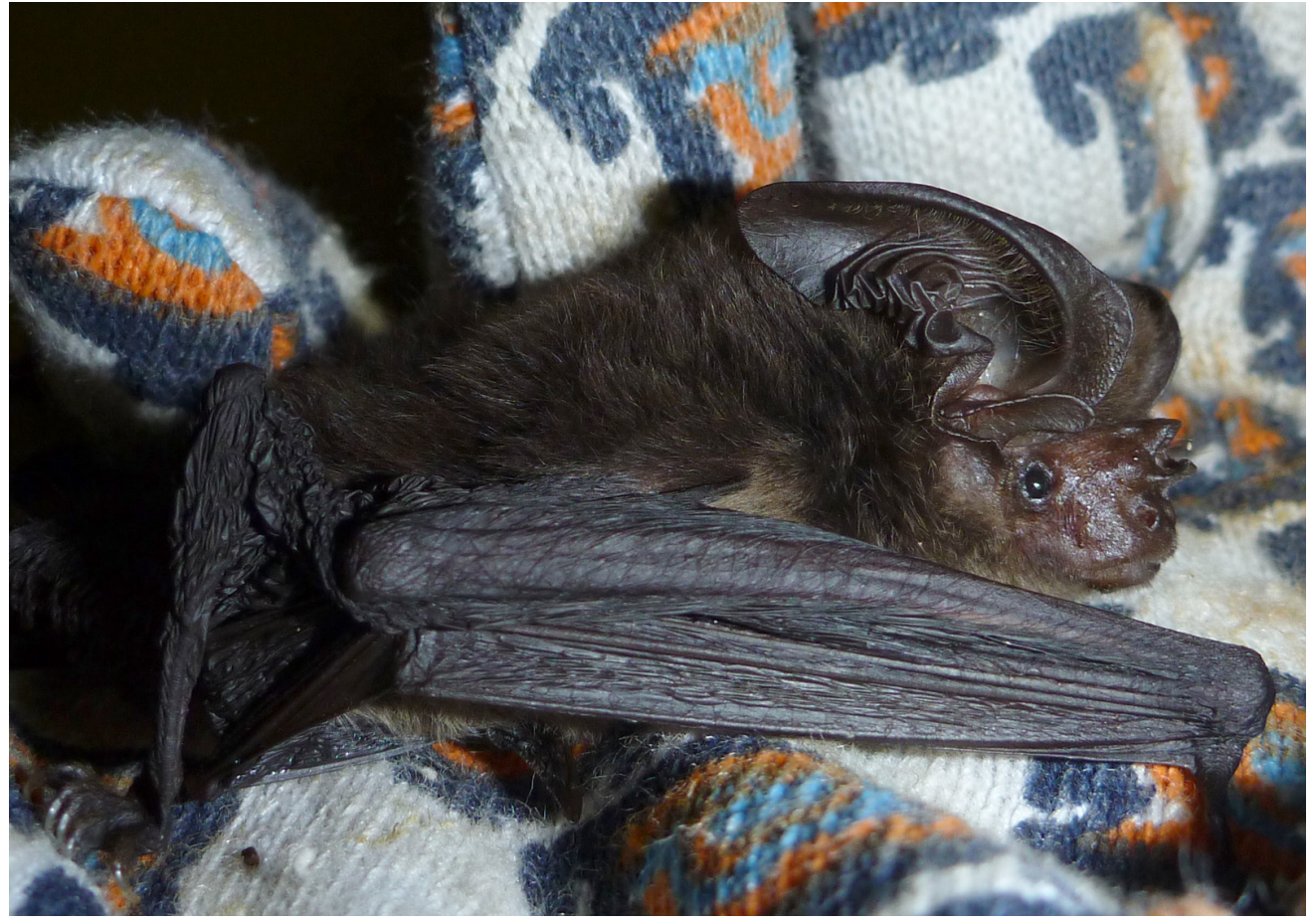
Figure 3. The live Pharotis imogene captured near Oio Village, taken July 2012 illustrating characteristic large ears and tragus (scale, forearm length = 39.6 mm).

were determined using a 60CSx Garmin ® GPS.