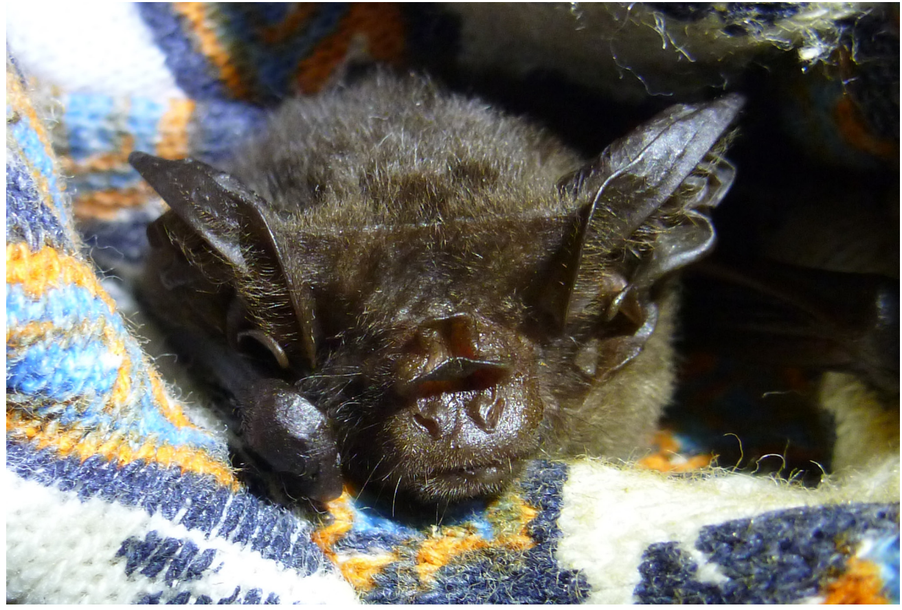
Figure 4. Pharotis imogene from near Oio Village, live animal showing nose-leaves and skin membrane joining both ears (scale, least distance between nostril margins = 2.5 mm).

mm; head body length 50.12 mm, tibia length 18.93 mm, ear length (measured from anterior base of the tragus) 24.00 mm, calcar 15.04 mm, body weight 7.70 g. The teats were rudimentary, and it was not clear if the animal was nulliparous.