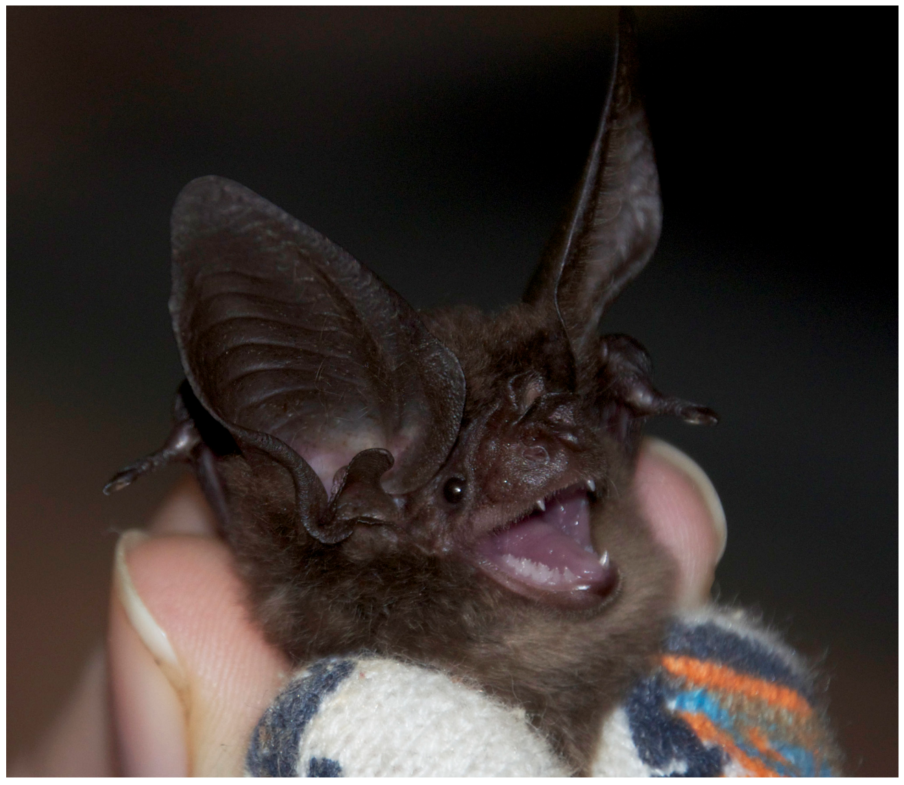
Figure 5. Pharotis imogene from near Oio Village, live animal showing erect ears (scale, ear length from base of tragus = 24.0 mm).