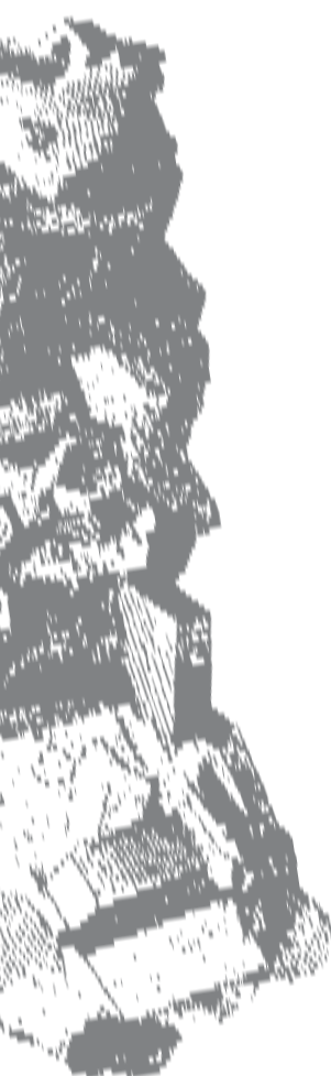
Inspiring the exploration of nature and culture