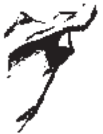
Giganotosaurus carolinii , from Patagonia, southern Argentina, greets visitors to the Museum

The BioMaps mapping system will help identify places of biodiversity significance