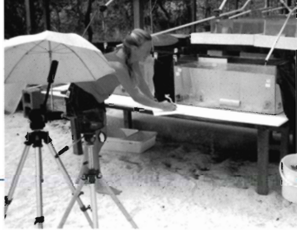
Uli Siebeck investigates the ability of fish to see ultraviolet light.

region of the otolith of this species should provide a chemical signature from its reef of origin. In addition, a chemical profile of the fish can be determined by sampling from the core outward to the edge of the otolith. This should allow Heather to determine life history features of the fish such as its residence time near a particular reef.