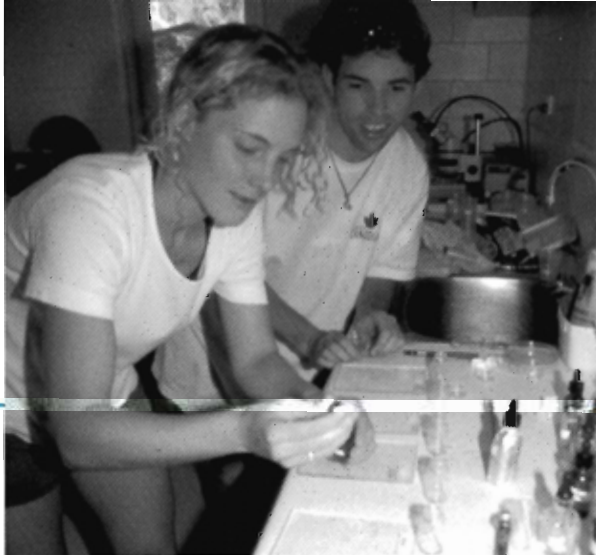
University of Guelph students conduct research in the Purves Laboratory.