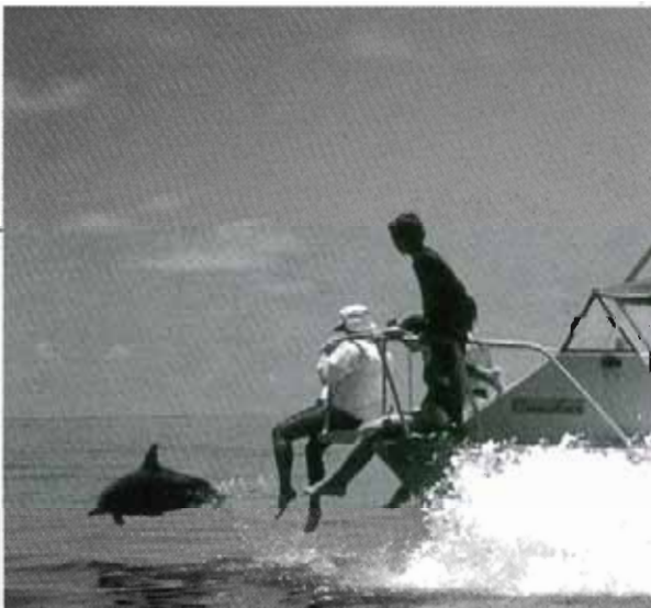
Dolphin joins the ride.