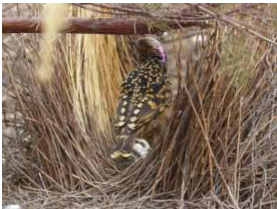
Male Western Bowerbird.

Botanic Gardens and parks as well as natural landscape features were a focus with roadside stops to look for birds and other creatures. Highlights were the Australian Arid Lands Botanic Gardens in Port Augusta and the Olive Pink Botanic Gardens in Alice Springs. Last year the Port Augusta Gardens were rated as one of the top 10 botanic gardens in the world; in part because of their Eremophila collection. Vicki said the best time to visit was August when most are flowering. While the Olive Pink BG also featured arid zone plants Murray and Vicki were fascinated by a male Western Bowerbird ‘doing his thing’ at his bower when a lady friend visited.