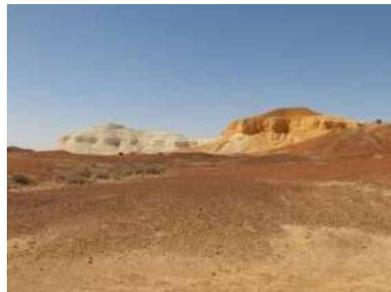
Kanku Breakaways Conservation Park; the feature called two dogs sleeping.