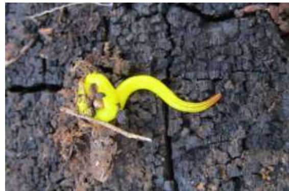
Yellow Planarian Worm.

The rain and wind on Friday night had brought down several large trees across the trail. Off the fire trail the leaf litter and logs were quite damp, and we found several types of fungi but no snails or worms. Yellow-tailed Black Cockatoos were calling and several groups of three flew through the trees often landing just out of range of our cameras. There were at least 2 young as we could hear their begging calls which were quite different to their usual screeches. On the way back we still turned over logs but didn't find much; a small sluggish skink, a millipede and then hurrah ..... at last a yellow worm. It was curled up and took a while to show the faint brown stripes on its head. This is the fourth one found and it's good that one has been found in a different part of the park.