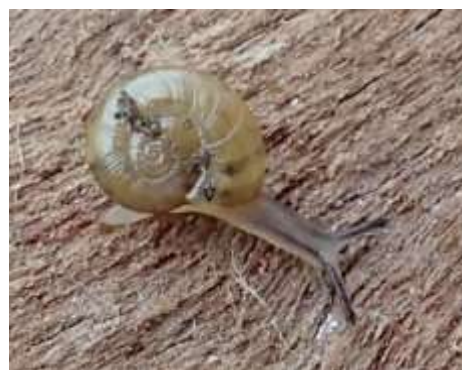
Above: Rhytididae Anabellia occidentalis , one of the snails found by the Australian Museum Team.

*these species do not appear on the currently available species list for Mt Canobolas SCA.