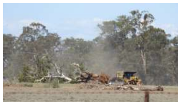
Land clearing west of Forbes.

The authors' conclusion states: "The lack of a finalised NVR map, the unconfirmed existence of a Native Vegetation Panel, and the complete underutilisation of protections such as the AOBV mechanism, mean that after two years, implementation of the new clearing rules in NSW remains without a clear foundation and without proper accountability." The full article can be accessed on-line and is worth reading. More importantly: What do we do about this state of affairs?