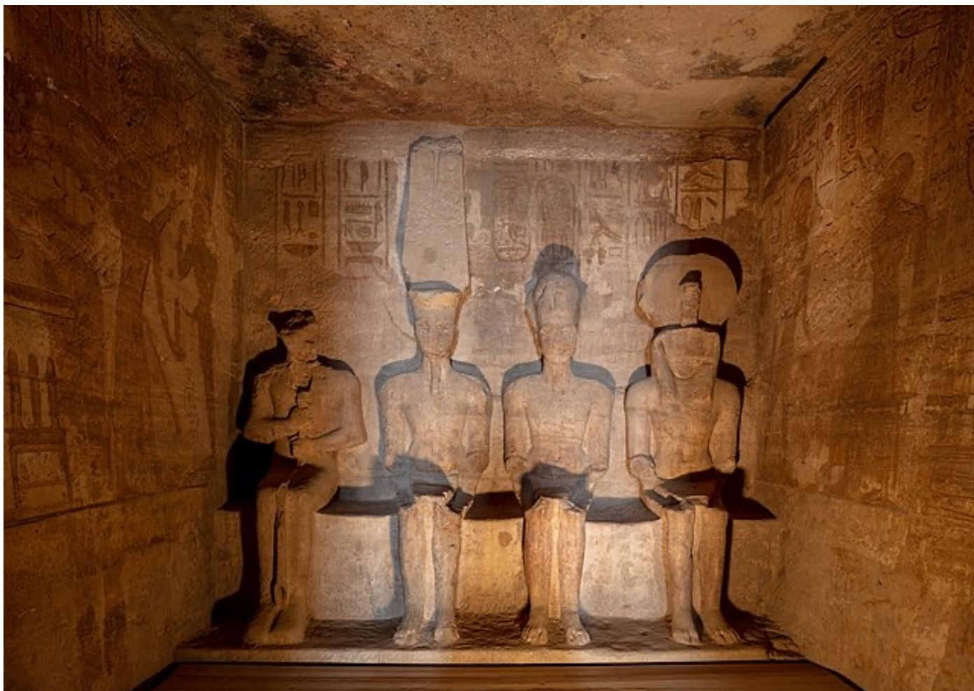
Source C: Ramses II sits alongside Egyptian gods Ra, Amun-Ra and Ptah in the inner sanctuary of Abu Simbel.

Pharaohs were the son of Re and the earthly reincarnation of Horus, son of Osiris. To the Egyptians, the pharaoh was a god themselves and mediated between the people of Egypt and their deities. At the exhibition you will be given the opportunity to see a range of objects that depict Ramses as a god including the innermost sanctuary of Abu Simbel. Ramses II is seated alongside the sun god Re, the chief state-deity Amun and Ptah, craftsmen god of Memphis, three of the most important Egyptian deities.