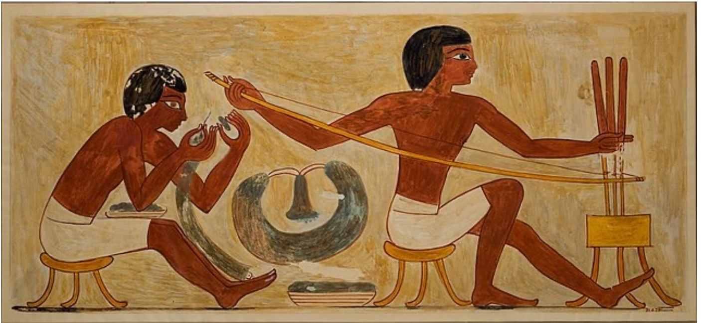
Source Z: Stringing and Drilling Beads in the Tomb of Rekhmire

Jewellery including rings, earrings, pectorals, necklaces, girdles, amulets and bracelets were worn by both men and women and most social classes. Egyptians were often buried with some form of jewellery, with the materials and quality indicating the status and wealth of the owner. Wealthy individuals wore items made of gold, semi-precious and precious stones, while those from lower social classes wore jewellery made of bronze, wood, faience, clay and other cheaper substitutes. Much about Egyptian jewellery is learned from the wall paintings that depicted it, such as in the tomb of Rekhmire which showed workers drilling beads with bow drills while others string them to create a necklace.