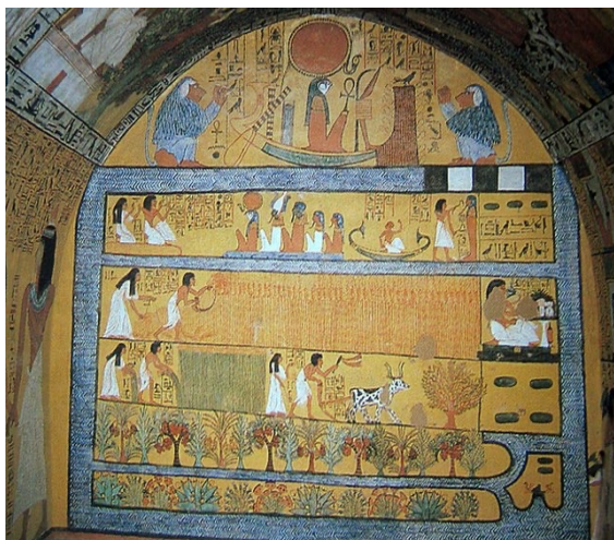
Source U: Tomb of Sennedjem Anonymous Unknown author, Public domain, via Wikimedia Commons

Using the sources and your own research locate elements of Egyptian funerary customs and afterlife beliefs in these illustrations