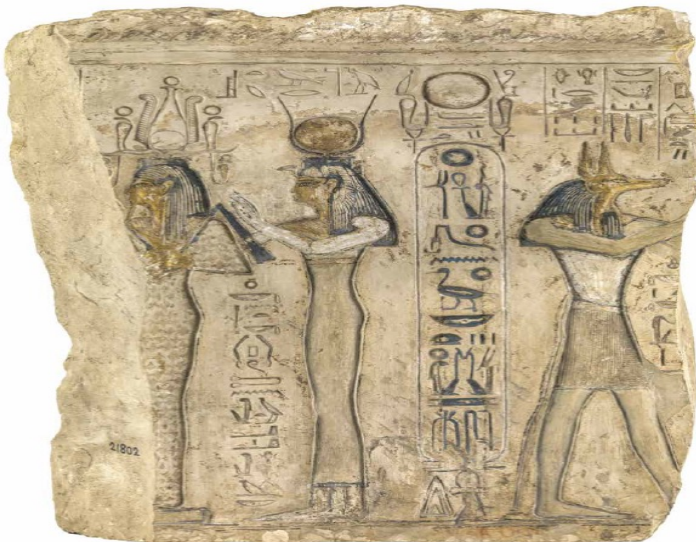
Source X: Painted and Gilded Limestone Relief of Deities and Cartouches of Ramses II

You will see the following examples of art at the exhibition. What does the evidence reveal about the religious and political role of art?