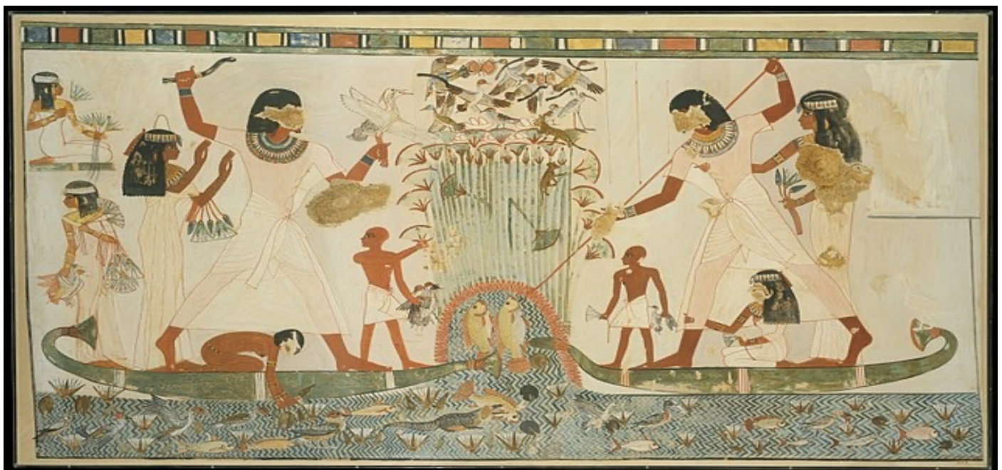
Source B: Menna and Family hunting in the marshes in the Tomb of Menna

The History of Herodotus, By Herodotus (gutenberg.org)