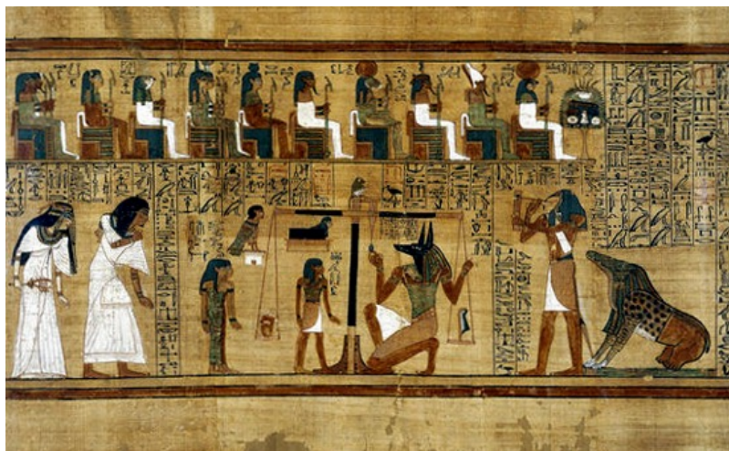
Source V: Papyrus of Ani British Museum, Public domain, via Wikimedia Commons